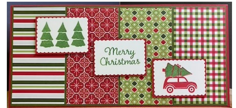
Festive Post: DSP cut 2" x 3 3/4" (4) CS 3 7/8" x 8 3/8" stampwithtlic.com