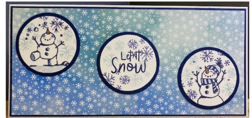
Snowman Season: 2" and 2 1/4" circle punch, DSP 3 3/4" x 8 1/4"