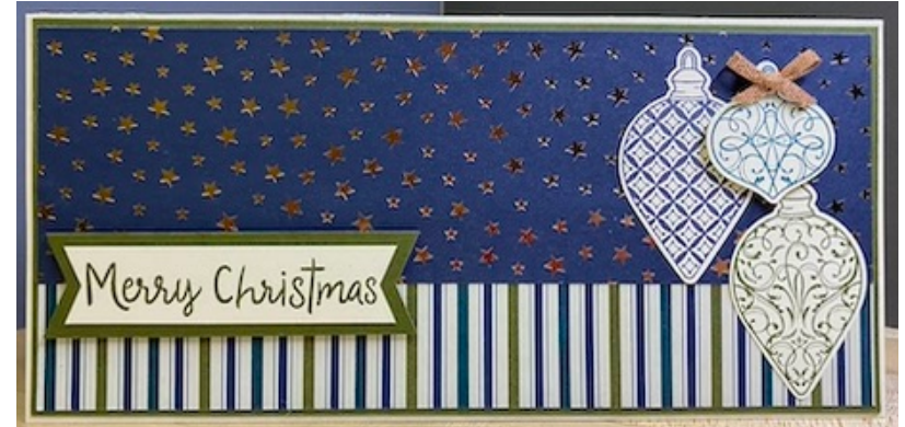
Christmas Gleaming: DSP 8 1/4" x 2 1/2" & 8 1/4" x 1 1/4"