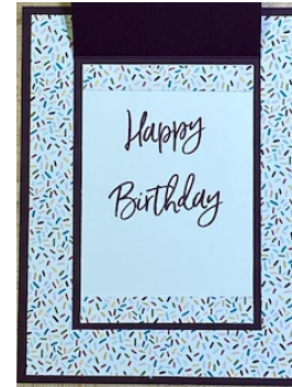
Inside Mini Card Base

Diecut: Scalloped Contour Basic Rhinestones colored with coordinating color Stampin' Blend Marker