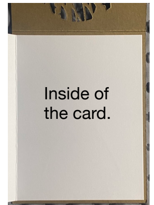
Inside of the card.