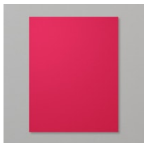
Real Red 8-1/2" X 11" Cardstock [102482] $11.50

I made all the card bases for each of the cards, instead of using the premade Memories and More Cards. Mainly because I used the 3"x4" cards on regular A2 card bases. Measurements are given for each of the card bases I made. I kept these cards pretty simple, but layers of paper make them pop. Some of them could probably use some Basic Rhinestones if you want to give them some sparkle. This Memories and More Card Pack will be available starting September 4, 2024.