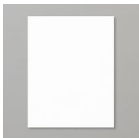
Basic White 8 1/2" X 11" Cardstock [159276] $13.00