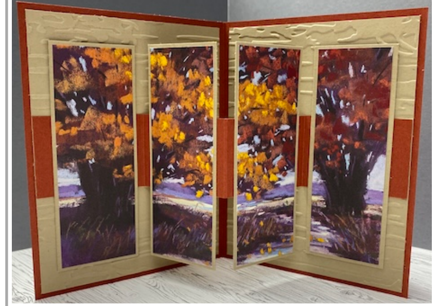
stampwithtlc.com. Images @ 2024 Stampin' Upl

Cajun Craze Strip: 1 \frac{1}{2} " x 8 \frac{1}{4} " scored at 2 \frac{1}{8} ", 4 \frac{1}{8} ", & 6 \frac{1}{8} " (The center score is a mountain fold the other two are valley folds. Cut a 4" x 5 \frac{1}{4} " piece of Very Vanilla for the back of the card.