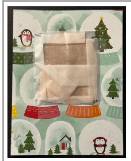
5. Tape the faux shaker piece on the back of the DSP so that it covers the hole.