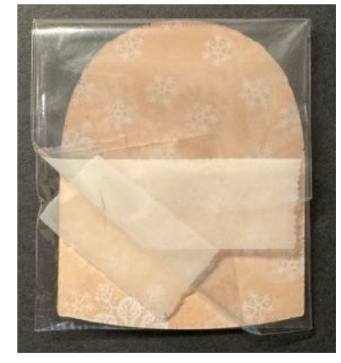
4. Fold and tape the envelope on the back. Do not pull to tightly when taping.