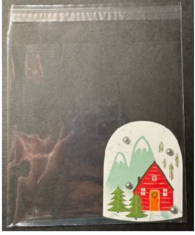
2. Place adhesive backed pearls onto the snow globe piece.