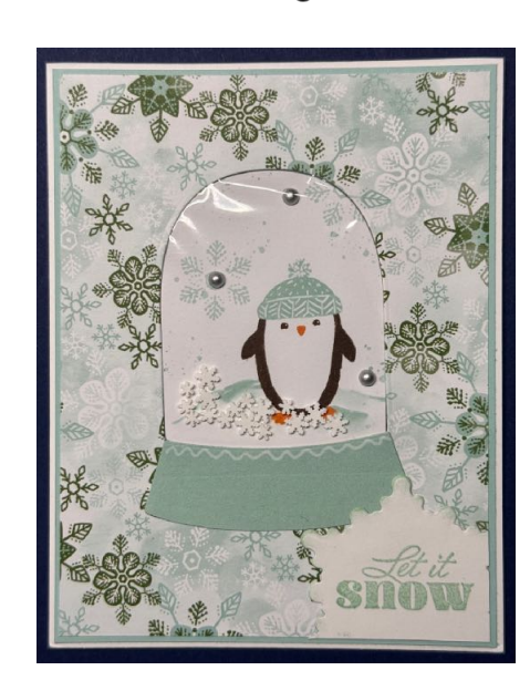
stampwithtic.com. Images @ 2023 Stampin' Upl