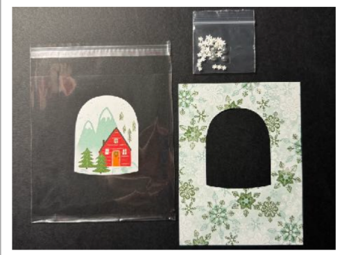
1. Materials needed for the faux shaker.