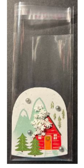
3. Put shaker pieces in the bag on top of the die cut. Be careful to keep them in the center while taping the back.