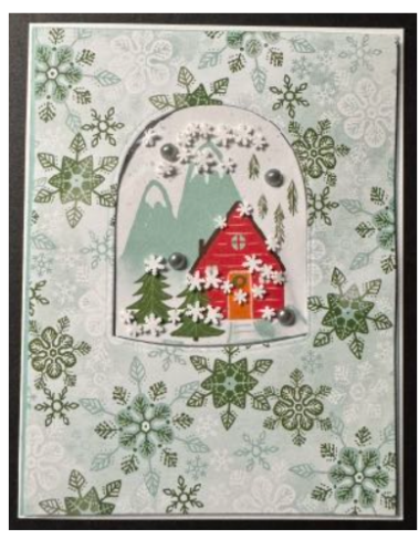
7. Now attach to the card front. OOPS: I forgot to glue on the snow globe base and snowflake.