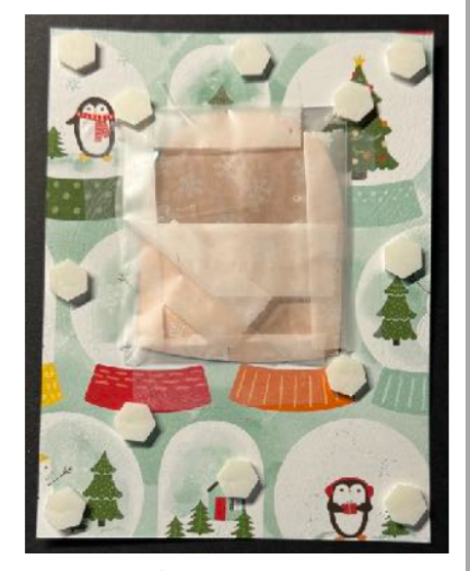
6. Add Stampin' Dimensionals all around but not on the envelope or glue along the outside edge.