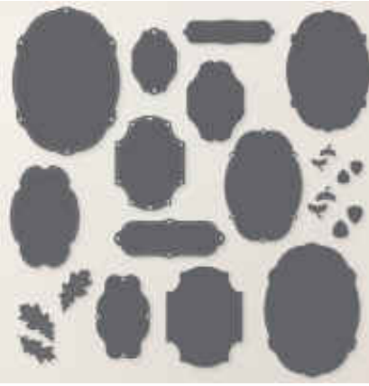
Sweet Words & Labels Dies [167627] $37.00