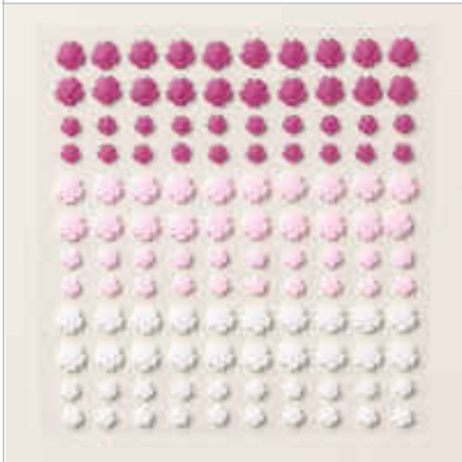
Dreamy Flowers [167916] $9.50