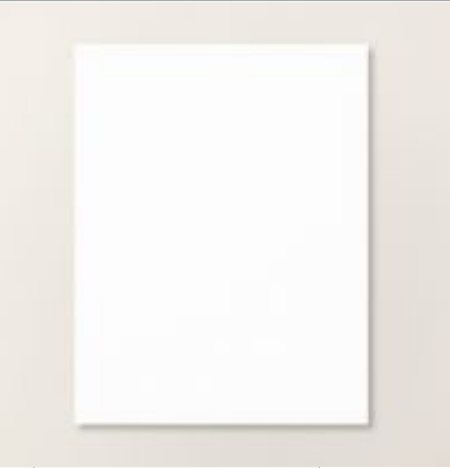
Basic White 8 1/2" X 11" Cardstock [166780] $14.00