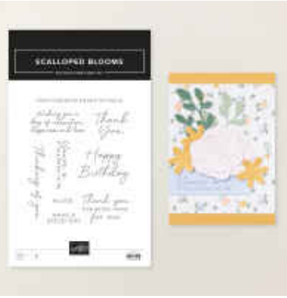
Scalloped Blooms Photopolymer Stamp Set (English) [167639] $20.00