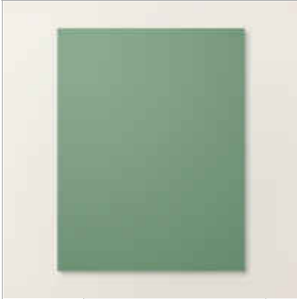
Peaceful Pine 8 1/2" X 11" Cardstock [167691] $14.00