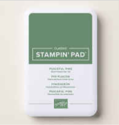
Peaceful Pine Classic Stampin Pad [167679] $14.00