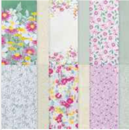
Velvet Meadow 12" X 12" (30.5 X 30.5 Cm) Specialty Designer Series Paper [167904] $17.00