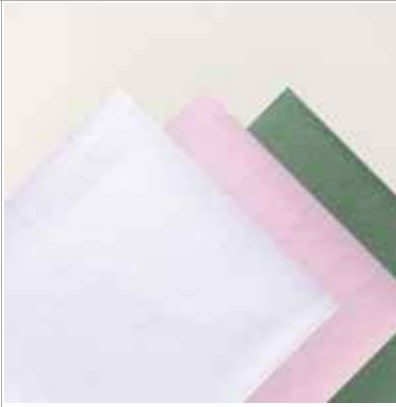
Velveteen Assortment 12" X 12" (30.5 X 30.5 Cm) Specialty Paper [167915] $12.00