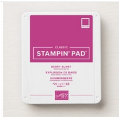
Berry Burst Classic Stampin' Pad [147143] $9.00