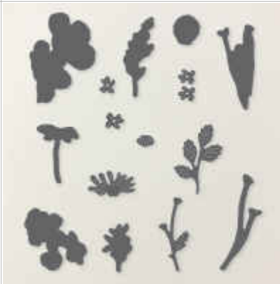
Flowering Meadow Dies [167911] $25.00