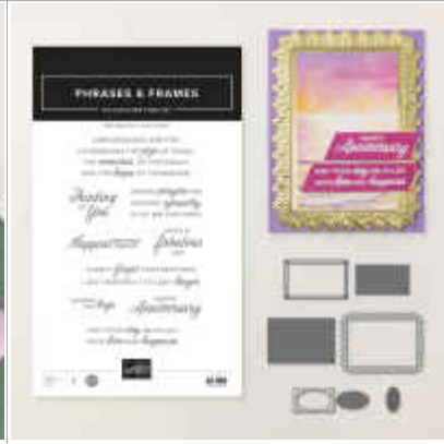
Phrases & Frames Bundle (English) [167587] $49.50