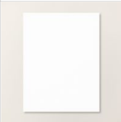
Basic White 8 1/2" X 11" Cardstock [166780] $14.00