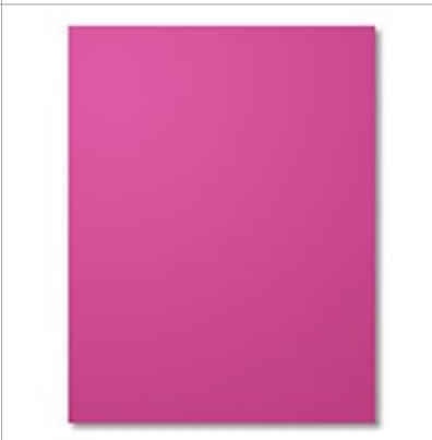
Berry Burst 8-1/2" X 11" Cardstock [144243] $14.00