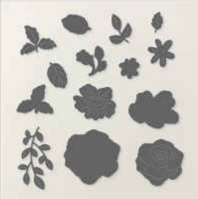
Boutique Blossoms Dies [167653] $32.00